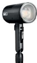
B240 HSS DC Type