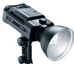
B360 TTL DC Type