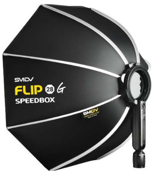
Flip G Series Softbox