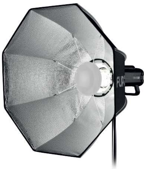
FLIP Beauty 24 (Dia 60cm)

It is a Beautydish product that blocks the light of the light source concentrated in the center with a reflector and creates a reflection effect to create a brighter and clearer light. Unlike conventional products with fixed shapes, Flip-type products reduce volume and weight significantly and increase portability.