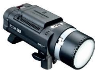
B500 TTL DC / AC Type