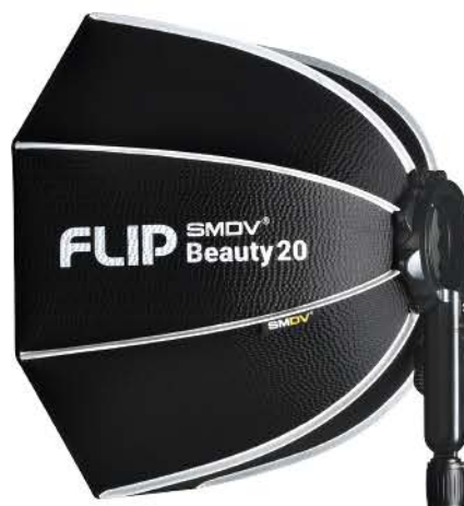
FLIP Beauty 20 (Dia 50cm)