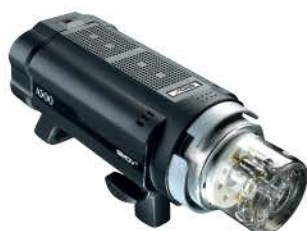
A500 AC Type