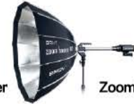
ZoomBounce - 100