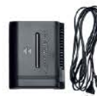
Battery AC Pack Only B500