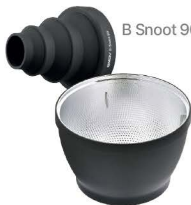
B Snoot 90