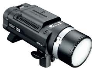
B500 HSS DC / AC Type