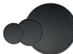
Honeycomb Grid HC-120 / HC-170 / HC-300