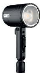
B120 HSS DC Type