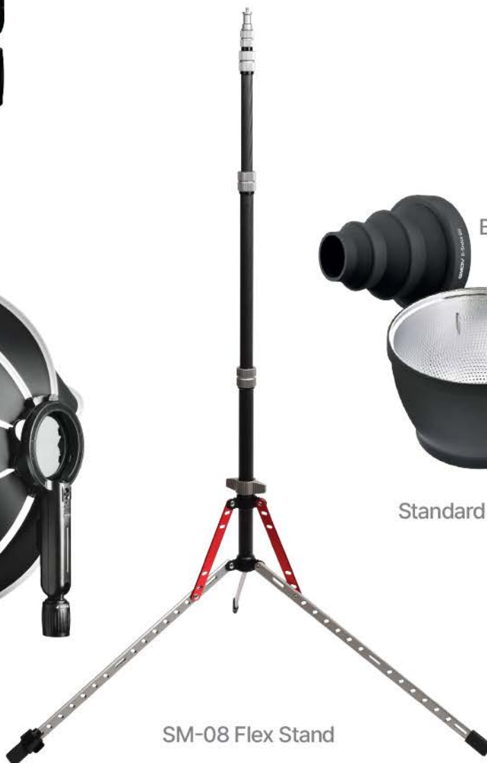
SM-08 Flex Stand